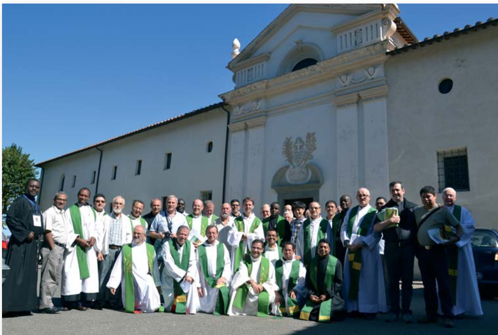
The Capitulars visiting Monte Argentario.