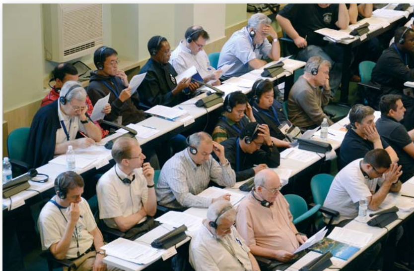
Chapter members gathered in the Aula.

ity in the Constitutions and I will analyze in a more extended way three aspects: consecration, the relationship between the Crucified One and those who are crucified, and a reference to the Paschal Mystery.