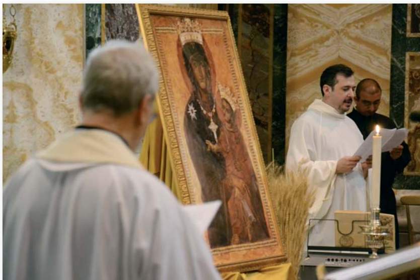
A liturgy of the Chapter before the icon of the “Salus Populi Romani” in the Chapel of St. Paul of the Cross.

on for a tradition (conformative tradition).