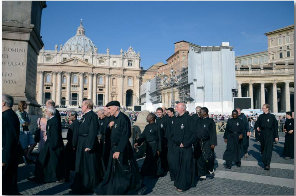
The Chapter members enter St. Peter's Square for the General Audience with the Holy Father.

Beside some economic issues, the last working day of the Chapter was given over to