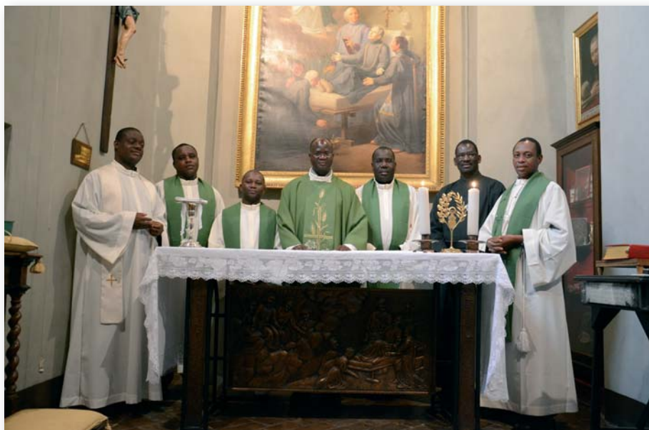
Passionists of the Configuration of Africa celebrating the Eucharist in the Room of St. Paul of the Cross.

To celebrate the feast of Saint Gabriel of Our Lady of Sorrows as an International Day of Passionist Youth.